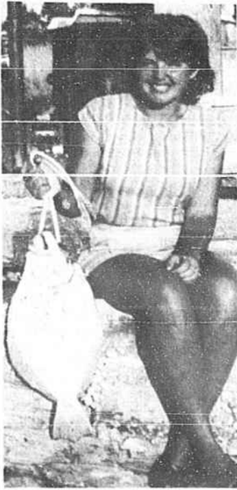
Wins Lady's Prize