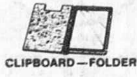
CLIPBOARD - FOLDER