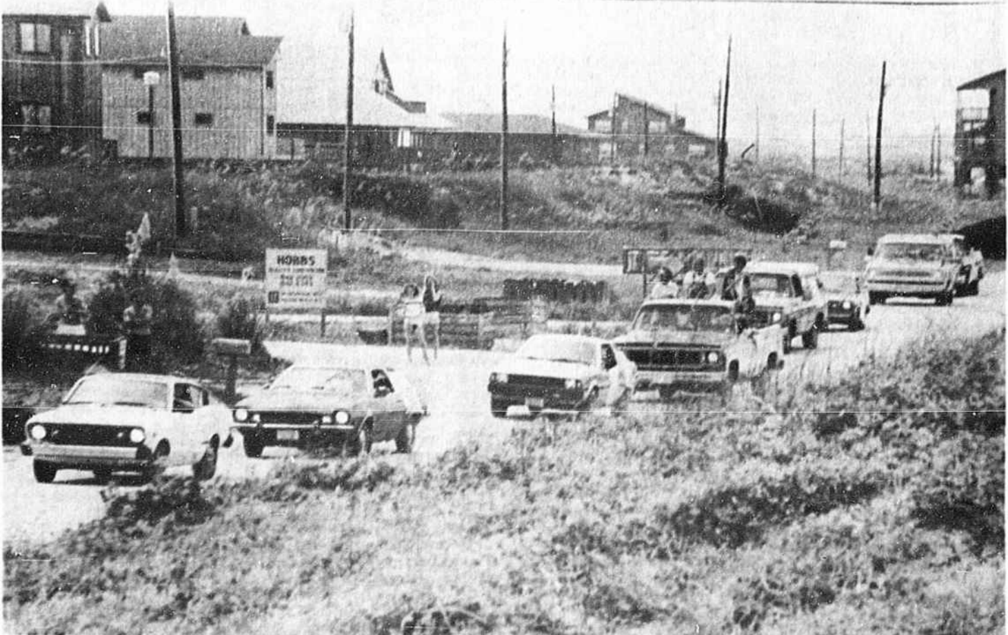
AFTER DRIVING past the barricade and to the west end of Holden Beach Sunday, the protesters returned to face possible trespassing charges.

Trespassing warrants were filed against 29 protesters who passed beyond the barricade.