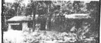
New! Great location near waterway with pool and tennis amenities available. Living room with cathedral ceiling and fireplace. Large wooded lot. Mid $80's.