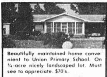
Beautifully maintained home convenient to Union Primary School. On 1/4-acre nicely landscaped lot. Must see to appreciate. $70's.

NEW HOMES COMPLETELY FINISHED, brick or siding, your choice. Craft Built Homes builds and finances. No red tape. Call 395-1102 anytime.