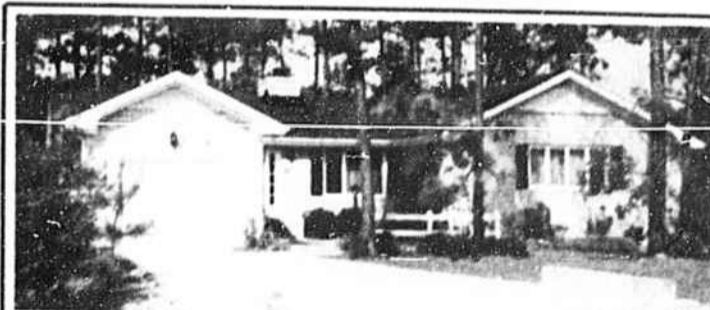
Carolina Shores 2-BR brick home overlooking 6th fairway. 105 ft. on the fairway. Fantastic view, large fireplace, rose garden, many extras. Designed for easy maintenance.