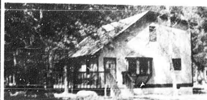
Calabash Acres Bright open spaces leading to lots of deck nestled in pretty oak trees make this home ideal for retirement or vacation living. 2 BR, 2 baths. $57,500.

CALL US FOR A COMPLETE LIST OF AVAILABLE LOTS AND HOMES IN CALABASH AND SURROUNDING AREAS.