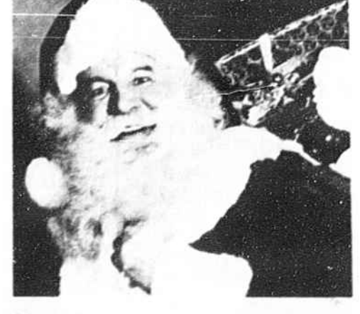
We use Kodak paper for a good look*

Ocean Isle Pharmacy Causeway & Hwy 179 Ocean Isle Beach 579-9710