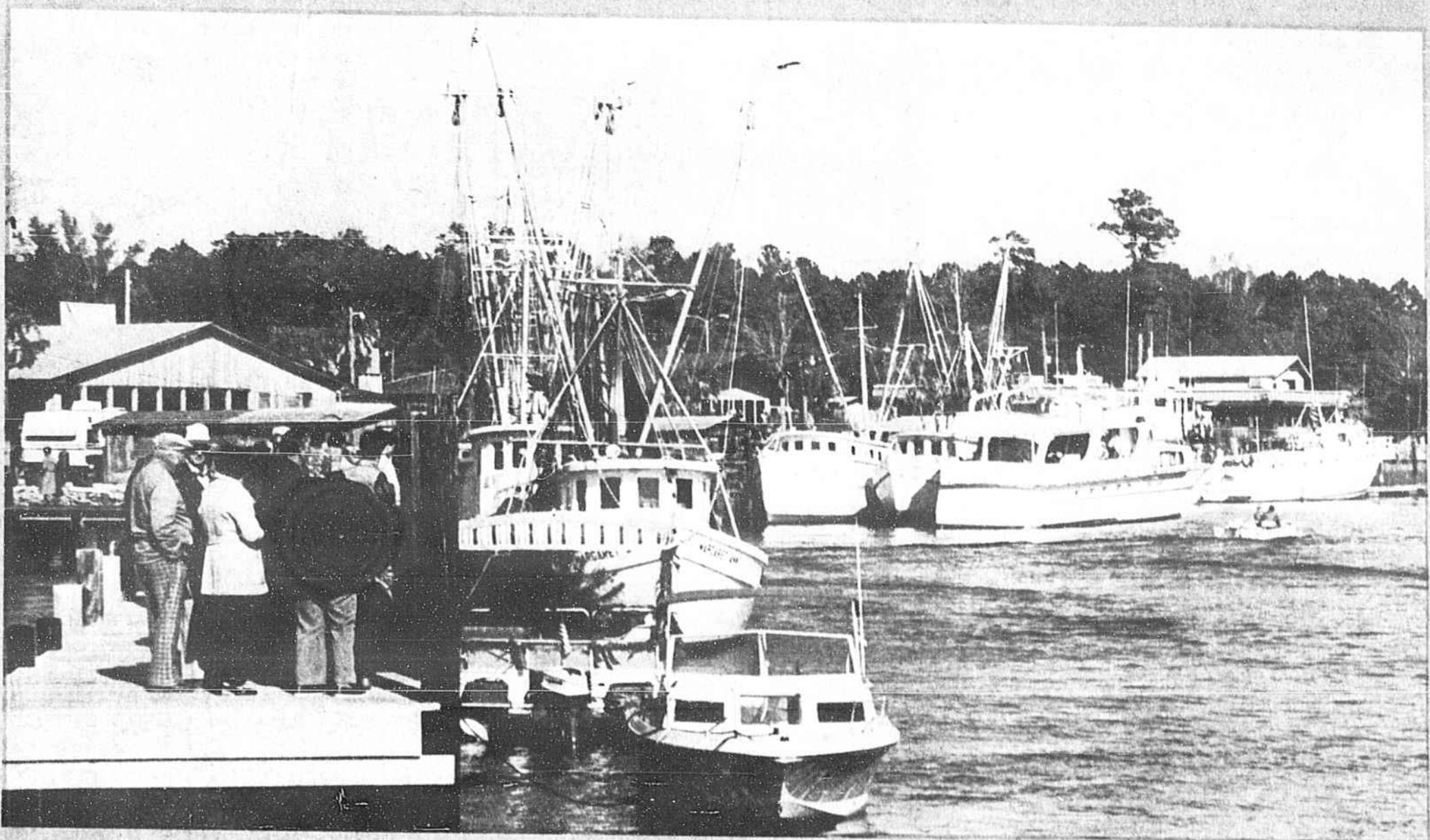
Spectators line the docks at Calabash as boats are readied for nautical parade to Little River.