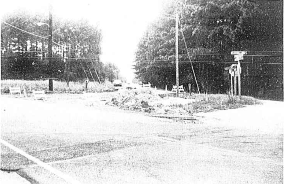
Island's To The Point

A staff member will be on hand to assist people with problems involving federal agencies or who want to express an opinion on important issues.