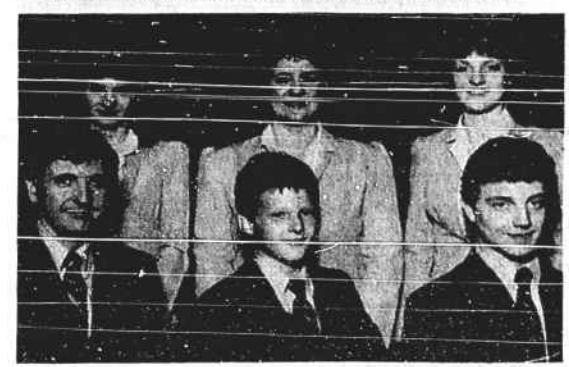
THE STANLEY FAMILY sings at Longwood Baptist Church Saturday