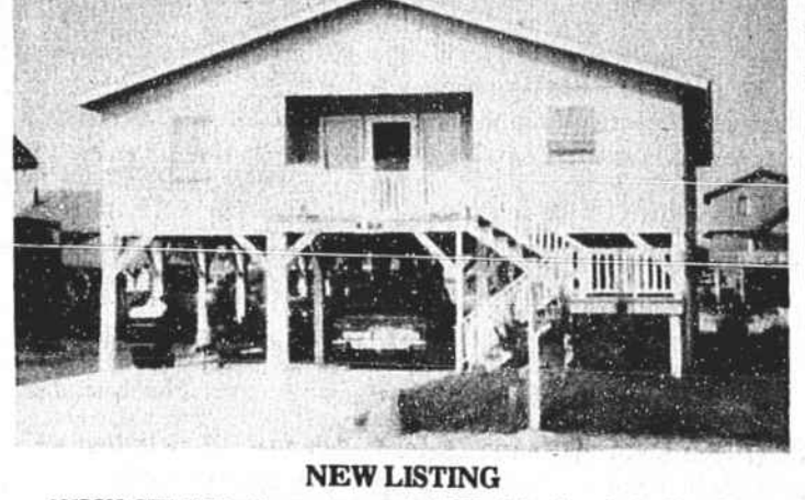
NEW LISTING ANSON STREET —Concrete canal, 4 BR, 2 baths, dock, fireplace, wallpapered, nicely furnished, never rented. $133,500.