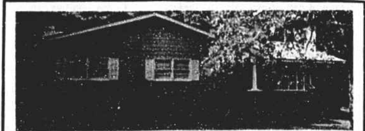
Copas Shores, Shallotte 3 BR, 2 baths, 1800 sq. ft., 16x24 storage building. 167x224 lot with swimming pool and tennis privileges. Beautiful view of lake. Shown by appointment. Call today!

CAROLINA SHORES RESORT *Below pre-sold prices! Several furnished condos in a complete resort. 1 BR, $40's; 2 BR, $50's. CALABASH *Persimmon Road—2 BR, 2-bath, almost-new cedar home on large lot, great room w/fireplace & loft. $85,000. *Ward Ave., Calabash Acres—Delightful brick/frame home set amidst extensive landscaping. 3 BR, 2 baths, porch, garage, second lot included. $89,500. LOTS, LAND, ACREAGE *Fairway.....from $16,000. *Off fairway.....from $10,500. *Acreage Estates.....from $8,500. *Carolina Shores North.....from $8,700. *Waterway.....Call for details. *16.4 acres w/house & barn between Hickman's Crossroads & Carolina Shores.....$125,000. CAROLINA SHORES *Beautiful & spacious brick 3-BR, 2-bath home on over an acre, soaring stone FP, solarium, dbl. garage, thoughtful landscaping. ....$106,000. MANUFACTURED HOMES *Ocean Forest—Like-new home, 3 BR, 2 baths, completely furnished, deck, concrete drive & carport, master bath has garden tub. ....$59,900. *Bonaparte's Retreat—Mostly furnished, 3 BR, 2 baths, utility & storage bldg., community pool, tennis, fishing lakes, close to Sunset Beach. ....$32,900. *Pine Bur Acres—Near the new Pearl Golf Courses, 2 BR, 2 baths, fully furnished & priced to sell. ....$25,000. *Ocean Pine Acres—Between Sunset & Ocean Isle Beaches, 2 BR, 1 bath, completely furnished. ONLY $22,300. A SPECIAL THANKS TO THE MANY OF YOU WHO JOINED US JUNE 6-7 FOR OPEN HOUSE WEEKEND