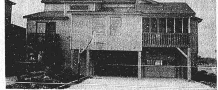
CORNER PENDER & SECOND On the T of the canal, 66-ft. lot. 5 BR, 3 baths, beautifully furnished, enclosed underneath, gazebo. Priced under replacement cost. $179,900.

LOTS UNION STREET —Concrete canal, $85,000. SECOND ROW —Lot 2, near High Point Street. Was $78,000. Now $60,000. SECOND ROW —Near Leland Street. Was $79,900. Now $69,900. SECOND ROW —Corner High Point Street. Was $79,900. Now $65,000.