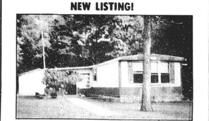
Bonaparte's Retreat —Fully furnished, 2-BR, 2-bath home (split plan), Florida room, landscaped, pool, tennis, fishing lakes. NICE. Priced to sell. $46,900.