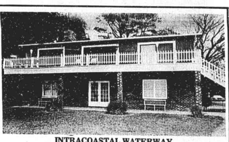
INTRACOASTAL WATERWAY OCEAN ISLE ESTATES —New listing. Well-constructed 2,000 sq. ft. brick home on large waterway lot. 4 BR, 3½ baths, great room with fireplace. Basement playroom with wet bar and fireplace. Double garage. Ideal retirement or summer home. Reduced to $189,900.