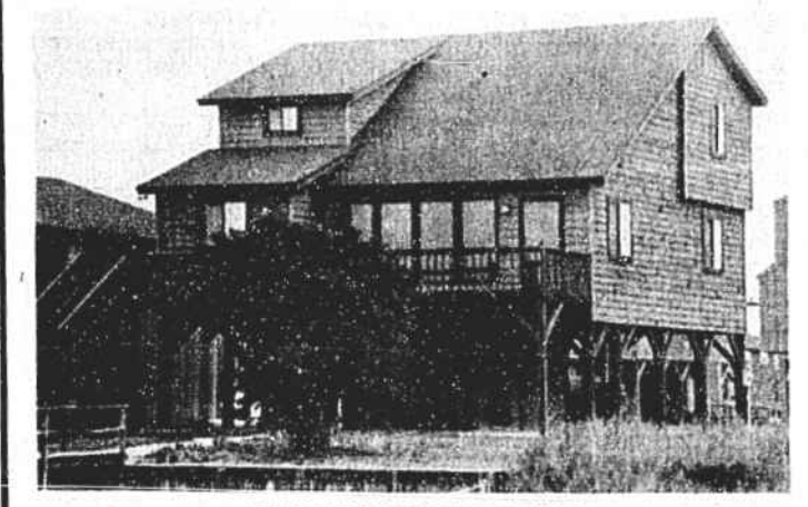
WILMINGTON STREET Beautiful 4-BR, 2-bath natural canal home. Like new! Boat dock, C/H/A, all appliances. Good rental! $134,900.