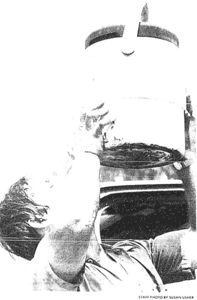
Fireman Cools It

.Endorsed a house-numbering system proposed by the U.S. Postal Service for the town of Shallotte. Houses would be numbered on all streets by a using a grid system. It is not known when the system will go in-