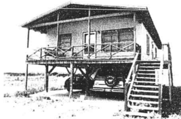
SECOND ROW —383 E. First Street. 3 BR, 1 bath, living room, kitchen, C/H/A, outside shower, covered porch, sundeck, carpet, furnished. $92,500.