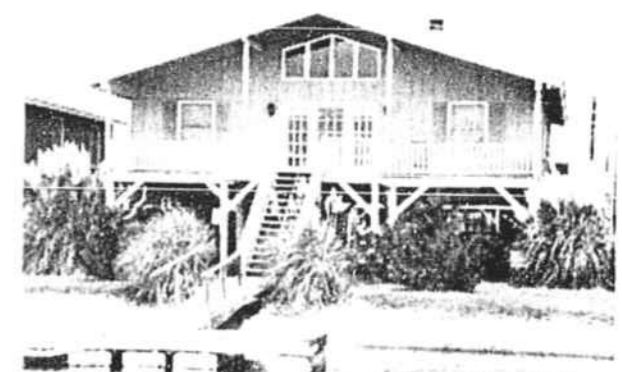
CANAL HOUSE —41 Richmond Street. Beautiful 4-BR, 2-bath house with living room, kitchen, C/H/A, ceiling fans, fireplace, outside shower, covered porch, sundeck, fully carpeted. Remodeled, nicely kept. $137,900.