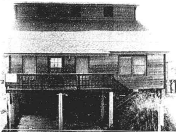
13 ISLE PLAZA —5 BR, 3 baths, living room, kitchen, C/H/A, carpet, DW, W/D, outside shower, sundeck. $139,900.