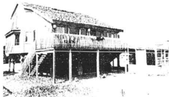
OCEANFRONT —168 E. First Street. 5 BR, 4 baths, living room and kitchen, C/H/A, carpet, DW, W/D. $315,000.