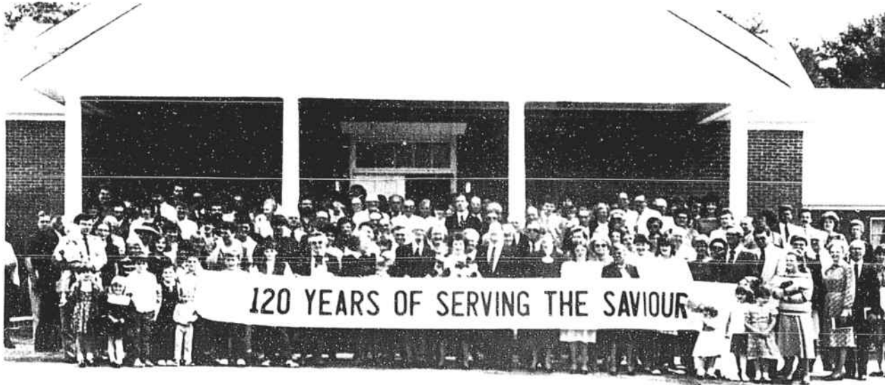
MORE THAN 200 people participated in Homecoming services at Antioch Baptist Church in Bolivia on Oct. 11, observing the church's 120th anniversary with special services and dinner. This is the first anniversary photograph taken since the late 1950s.