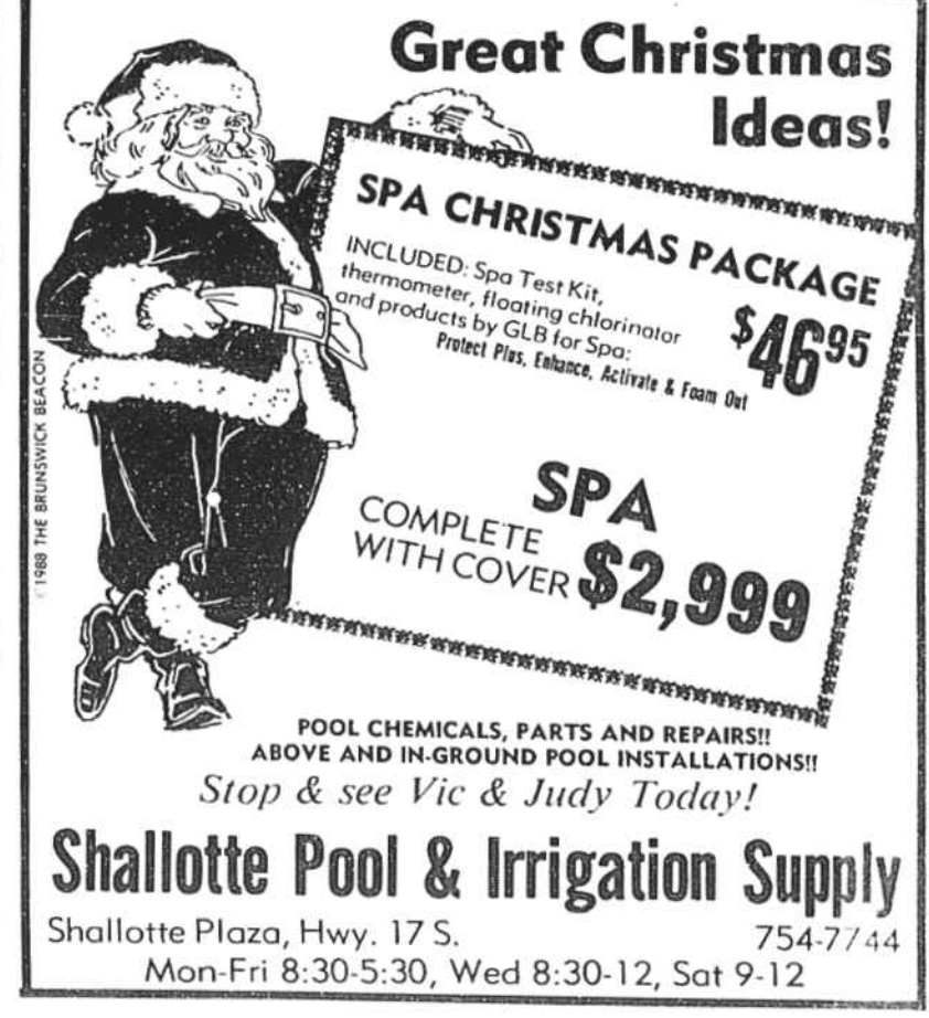
THE BRUNSWICK BEACON, Thursday, November 17, 1988-Page 9-A

Sale thru Sat., Nov. 26 Now that cold weather has arrived, stay warm with the latest in business and leisure pear at fashionable say