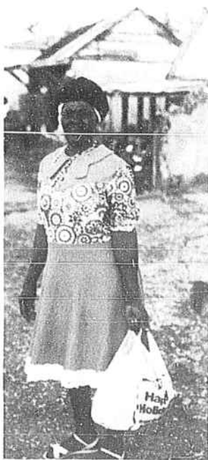
A BENBOW CHURCH MEMBER poses proudly with gift of food from mission team. Villagers' shanty-like homes are visible in the background.

In better days the main street of Benbow had been supplied with electricity, but service had not been restored since Hurricane Gilbert swept a devastating blow across the island last Sept. 12.