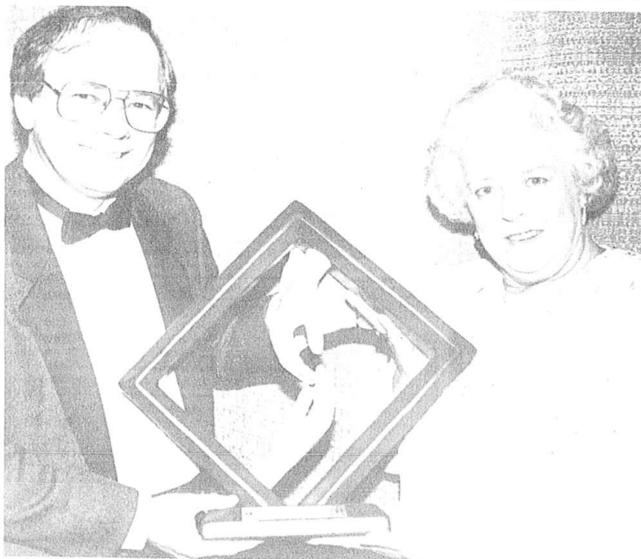
BCLC Receives First Award