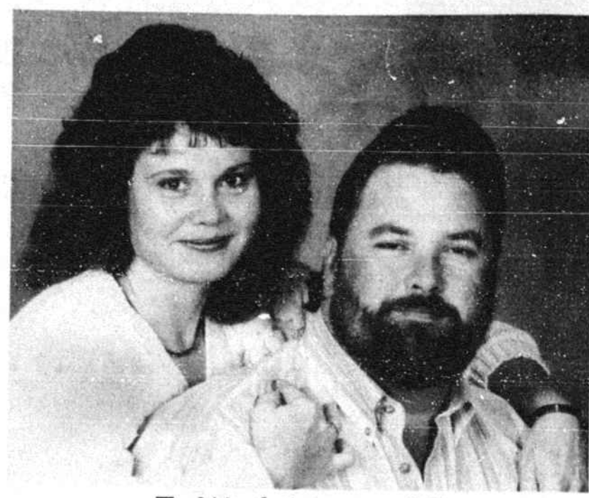
To Wed January 27

For more information on the Shape Up, contact event chairperson Becky Sledge at 457-6091.