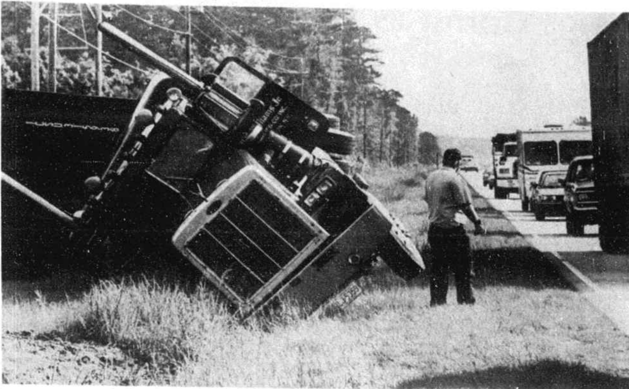
A TRUCK AND CONTAINER loaded with sodium dichromate crystals overturned on U.S. 17 north of Bolivia Tuesday morning, tying up traffic in both directions for several hours.