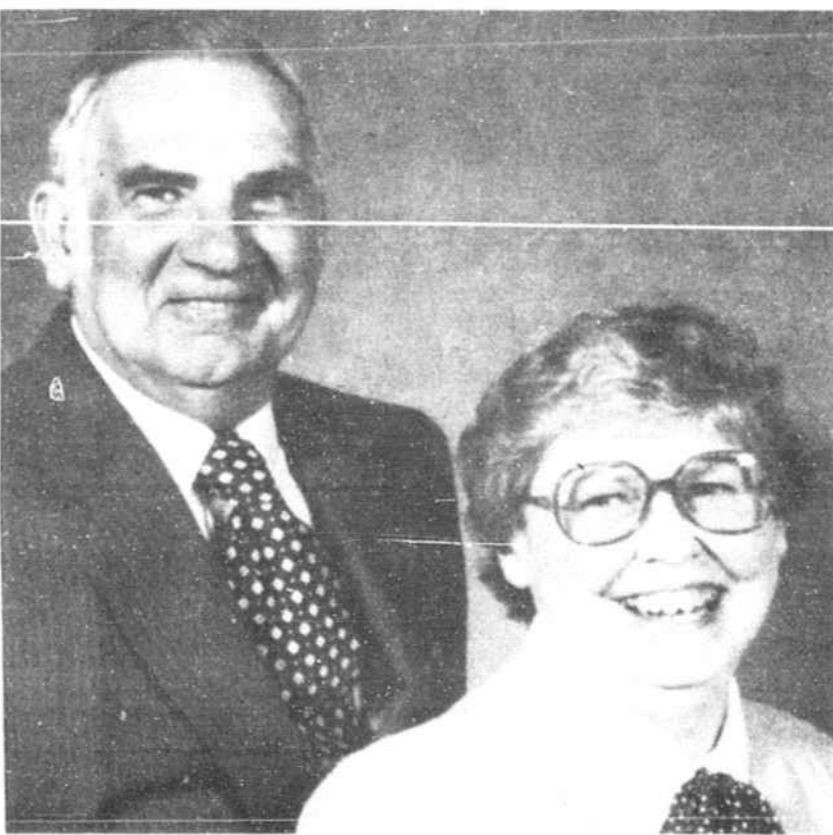
Married 50 Years