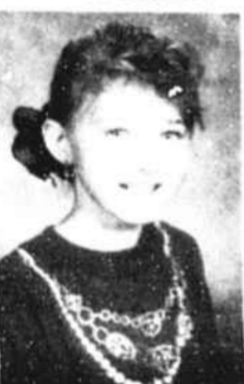
From, Grandma & Grandpa