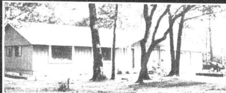
OCEAN ISLE BEACH-3-BR, 3-bath home on 1/4 acres, located within 5 miles of beach and several golf courses. HOME IS LOADED WITH EXTRAS AND MUST SEE.....$134,500.

P.O. Box 4749, Thomasboro Road, Calabash, NC 28470 (919)579-0192 • FAX #(919)579-0814 Licensed in North & South Carolina