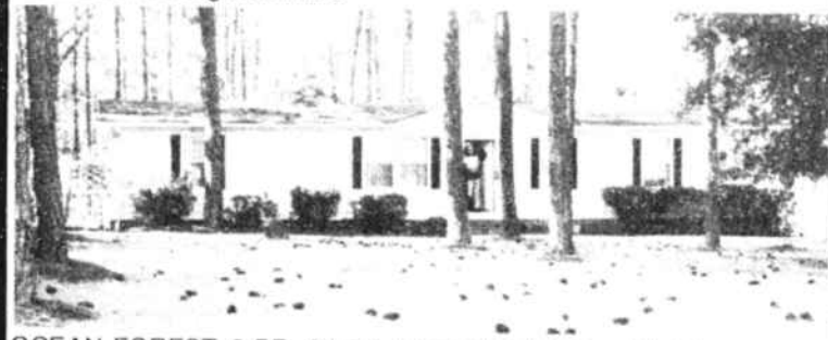
OCEAN FOREST-3-BR, 2-bath home with fireplace, Florida room and storage building, all on beautiful wooded lot. GREAT LOCATION AND HOME IS IN EXCELLENT CONDITION.....$65,900.