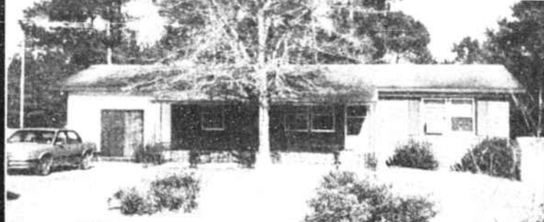
ASH-Brick 3-BR home in EXCELLENT CONDITION, has approximately 1500 sq. ft., fireplace with insert and located within 10 miles of Shallotte. GREAT HOME FOR RETIREMENT. Asking price.....$59,900. *Additional acreage available*