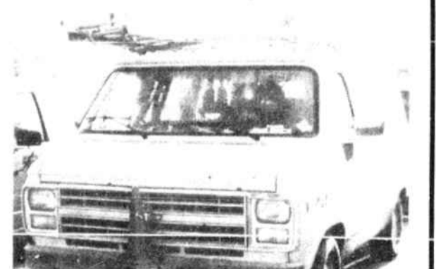
1985 CHEVROLET VAN