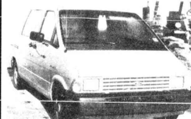
1987 FORD AEROSTAR VAN