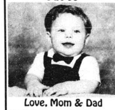
Love, Mom & Dad