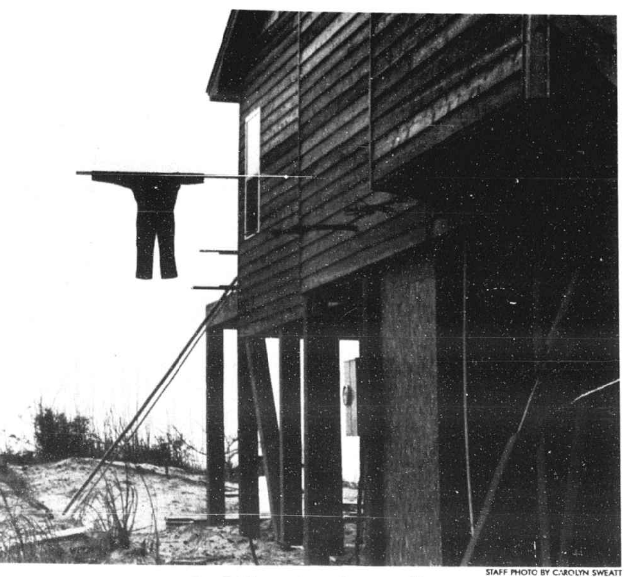
Just Hanging Around?

A construction worker at Ocean Isle Beach dries his overalls on a makeshift clothes line, causing passersby to do a double-take.