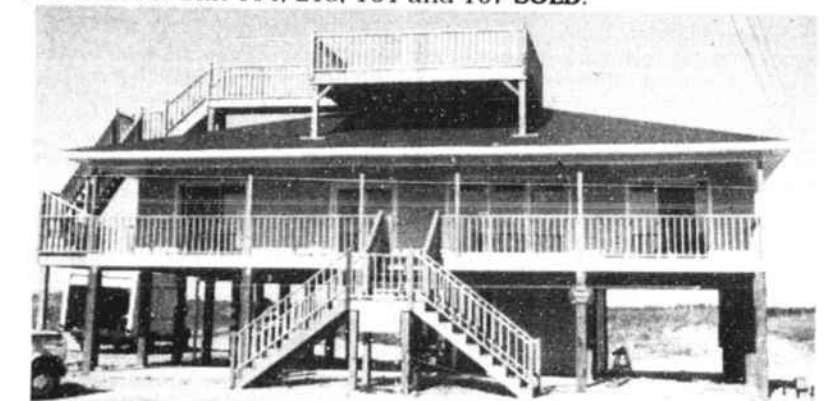
80 West First Street-5 BR, 3 baths .....$179,000.

OCEAN COVE -1, 2 & 3-BR units, LR/kit., C/H/A, carpet, DW, W/D, wet bar, balcony overlooking the ocean, Jacuzzi in MBR, furnished. From $84,500 to $205,000. Unit 103 and 112, UNDER CONTRACT . Unit 104, 215, 101 and 107 SOLD .