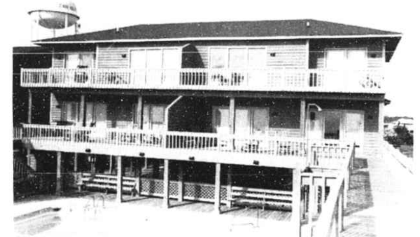
64 East First Street-Duplex, west side, 5 BR, 5 baths..$269,000.

BEACH VILLAS -2 BR, 2 baths, LR/kit., C/H/A, carpet, dishwasher, W/D, individual balconies. Unit B-3 $114,000.