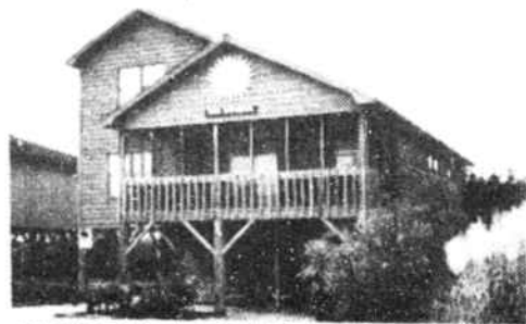
SUNSET BEACH-Furnished, 3 BR, 2 baths, plus loft and screen porch. A well-maintained house, close to the beach. Great rental. $146,900.