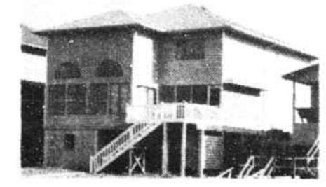
OCEAN ISLE-Second Street canal lot. 4 BR, 3 baths, 2 garages and partially furnished. Dock your boat right at your home. $233,000.