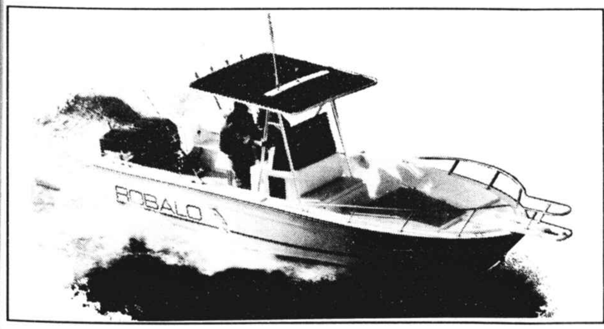
2320 Center Console

Standard Features Include: Fiberglass pulpit w/anchor roller, bolster pads, livewell, hand-held fresh water shower, console tackle box, hydraulic steering, VHF & AM-FM cassette stereo radios, fully foamed hull and much more!