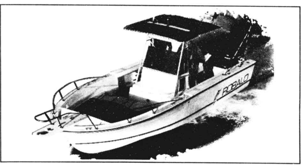
2520 Center Console

Standard Features Include: Fiberglass pulpit w/anchor roller, bolster pads, livewell, hand-held fresh water shower, console tackle box, hydraulic steering, VHF & AM-FM cassette stereo radios, fully foamed hull and much more!