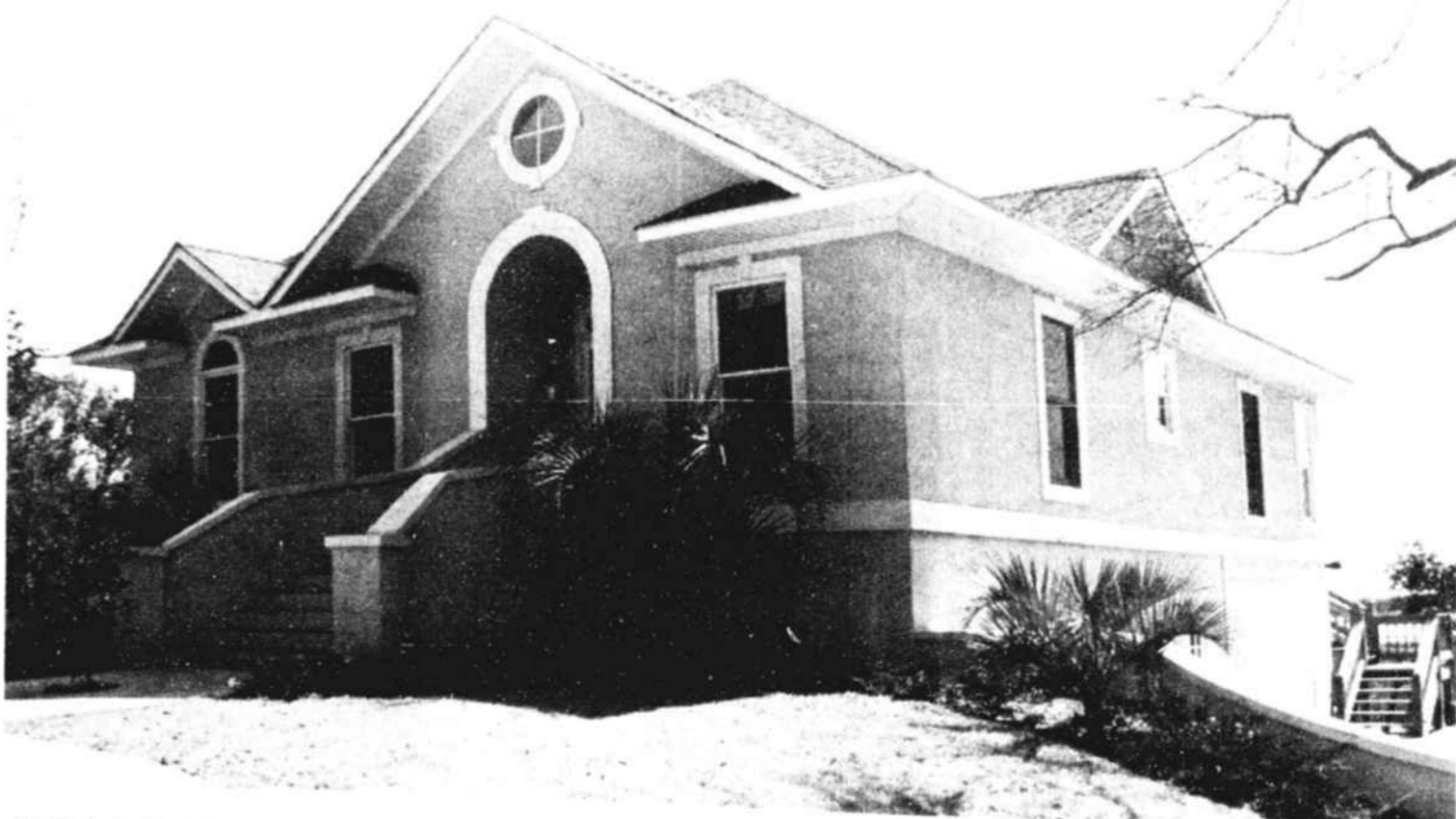
PINK STUCCO with white trim, the Wootens' stylish home overlooks the Intracoastal Waterway and Bird Island.

They chose a casual and orderly interior design in hues of muted teal and dusty rose contrasted with dramatic accents such as dark paisley and floral wallcoverings and upholstery. The touches are decidedly professional, reflecting Betty's background as a housing and home furnishings instructor at Salem College and as a designer and space planner for numerous schools, hospitals, banks, offices and auditoriums. (See PROFESSIONAL, Page 47)