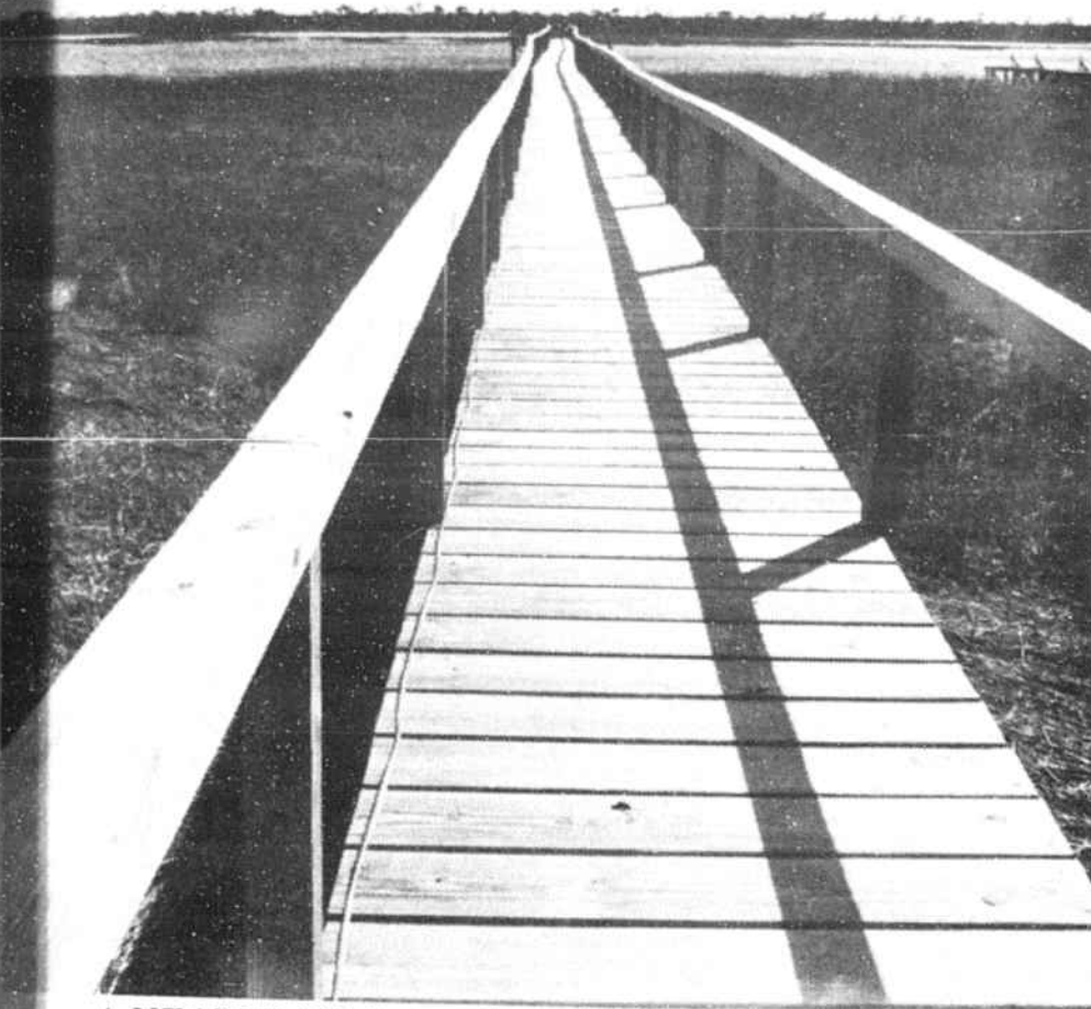
A NEARLY 400-foot walkway leads to the Wootens' dock.