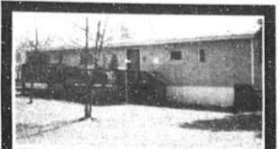
Forest Hills—Elm St., near Holden Beach, 3 BR, 1 1/2 baths. Home on 4 lots. Only $39,900.

LOTS 13 & 14 BROOKS ACRES , Seaside area. 803-546-6988 or 754-9345.