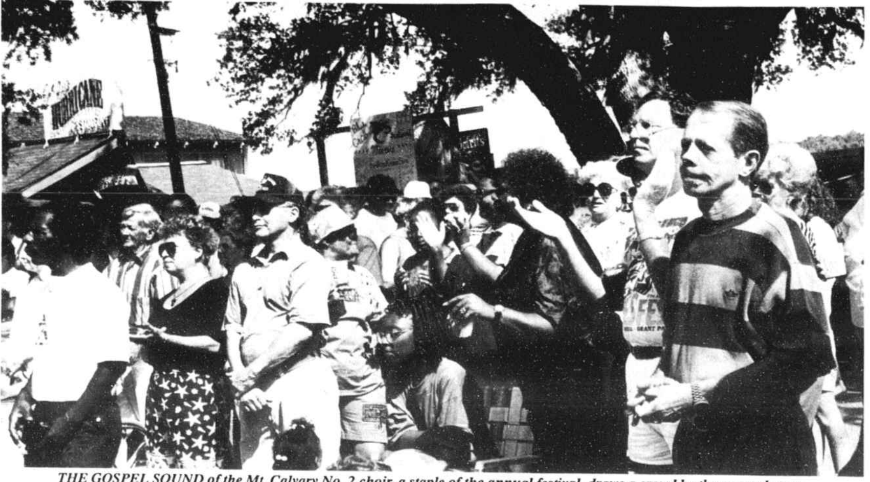
THE GOSPEL SOUND of the Mt. Calvary No. 2 choir, a staple of the annual festival, draws a crowd by the general store.