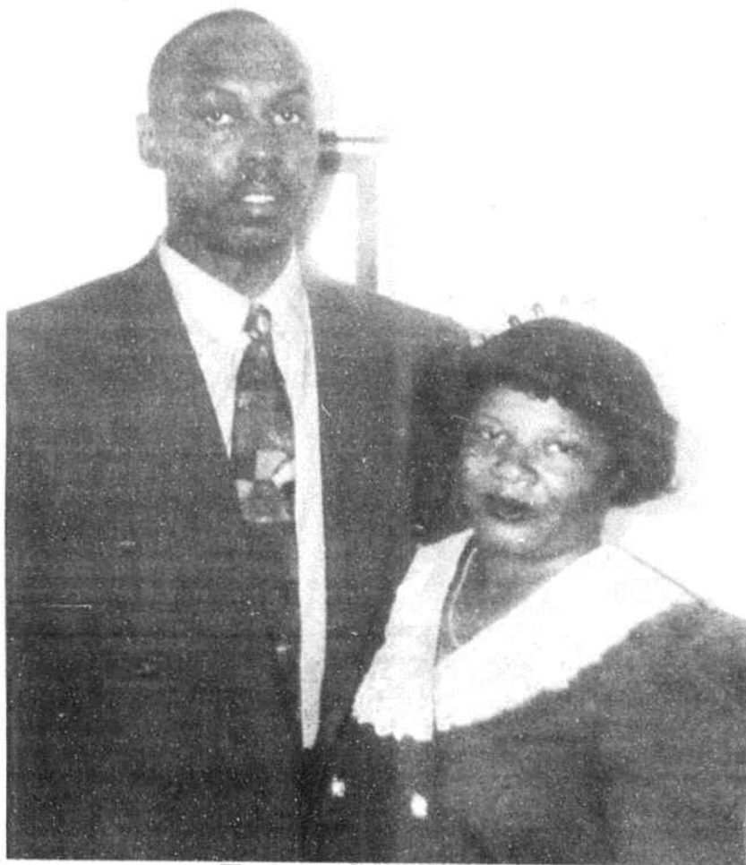
To Wed Saturday