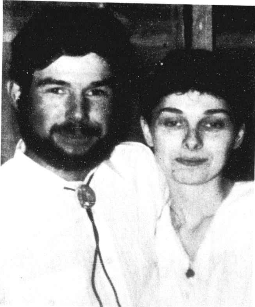
To Wed June 19