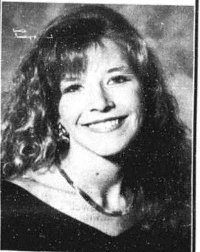
From Mom, Dad & the Gang