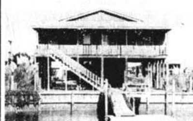
115 TUNA DRIVE