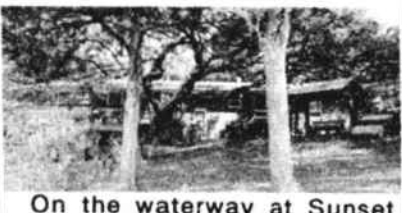
On the waterway at Sunset Beach-5 lots and one home. Fantastic views. Call to see. $695,000.