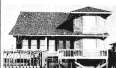
333 OCEAN BLVD. WEST

4 BR, 2 baths, 1 1/2-story home, newly painted. $112,000.