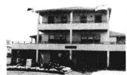
116 FERRY RD.

4 BR, 2 baths and fireplace, oceanfront. $225,000.