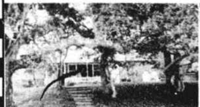
On the Shallotte River $199,500.