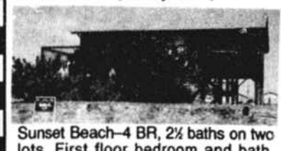
Sunset Beach-4 BR, 2 1/2 baths on two lots. First floor bedroom and bath, never rented. Great buy! $139,000.