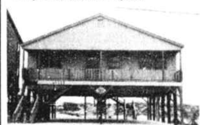
1081 OCEAN BLVD. WEST

Large 6-BR, 3 1/2-bath oceanfront house. Great rental. $279,000.