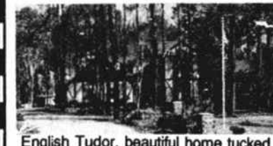
English Tudor, beautiful home tucked away in a cul-de-sac in beautiful Brierwood. Super buy! $159,900.