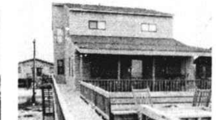
1013 OCEAN BLVD. WEST

Oceanfront 4 BR, 4 baths, beautifully decorated. $279,500.