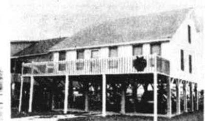
110 CLIPPERSHIP DR.

3 BR, 2 baths, den, on canal with dock. $123,000.