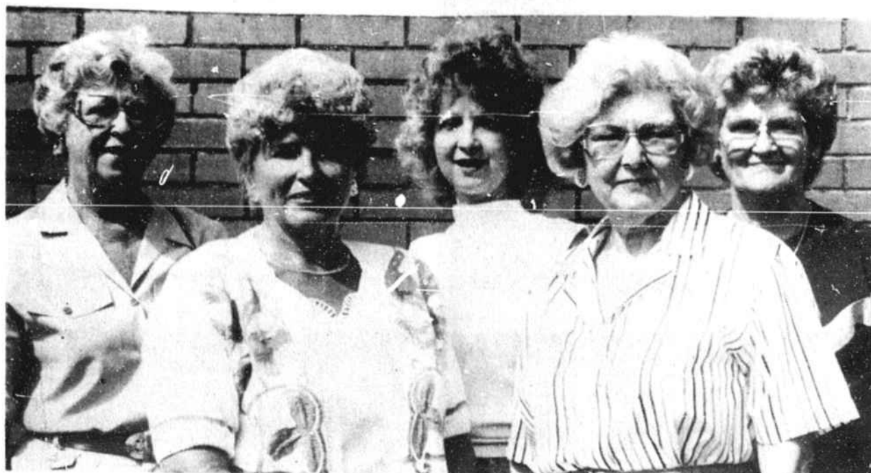
Garden Club Officers