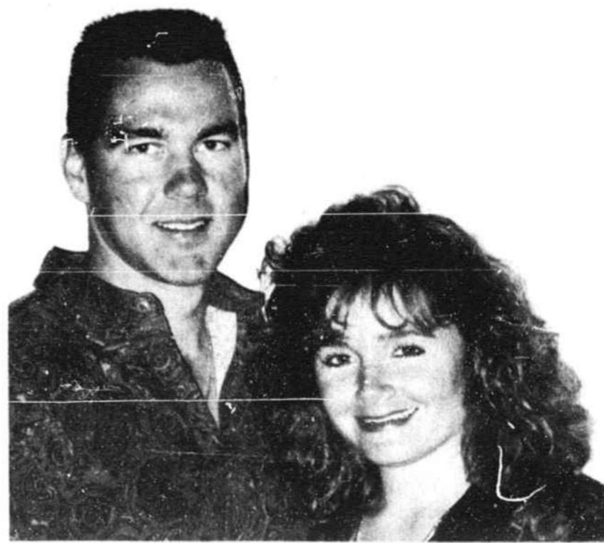
Aug. 14 Wedding Set

Plates will cost $3 each. The event is open to the public.