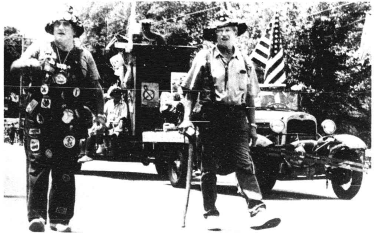
Hillbillies On Parade The Sudan Hillbilly Unit brought rustic charm to the N.C. Fourth of July Festival Parade in Southport.

A fire started by lightning often smolders for some time before it can be spotted, Pullen said, since lightning often strikes dead, hollow trees. "Sometimes it takes two or three days to show up." "This week will be critical for us," he continued. "We have a plane flying today to check for further lightning strike fires from the dry thunderstorms we've been having." Pullen spotted the Green Swamp fire Monday evening around 7:30 p.m. when he climbed the Bolivia fire tower to check after heavy smoke began drifting across the U.S. 17 four-lane at Bolivia. The smoke had traveled seven or eight miles before reaching a residential area and drawing notice. N.C. Forest Service fire towers are not routinely staffed in summer, he said. The fire is east of N.C. 211 about three miles north of Supply, across the highway from the general location of the Bear Pen Airfield. "We're just going to have to maintain the control lines and let it burn. There's no way to get water to it," said Pullen.