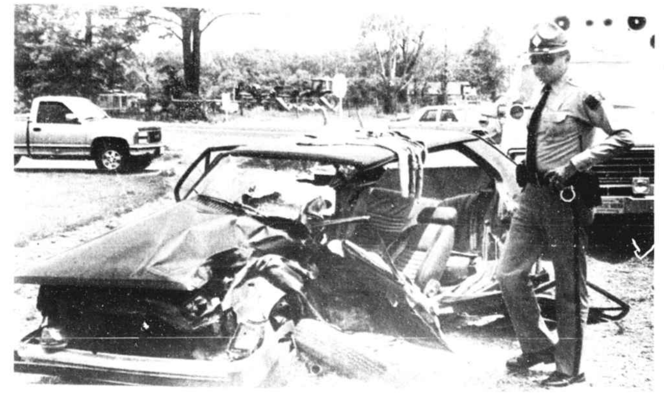
N.C. Highway Patrolman Bobby Wilkes investigates the scene of a two-vehicle accident Monday afternoon in Supply. Four people were injured when this 1986 Plymouth pulled into the path of a dump truck headed south on U.S. 17 at the Mt. Pisgah Road intersection. Wilkes said the driver of the car, Laverne Hill of Supply, was charged with running a stop sign. Hill and three passengers were taken to The Brunswick Hospital for treatment.