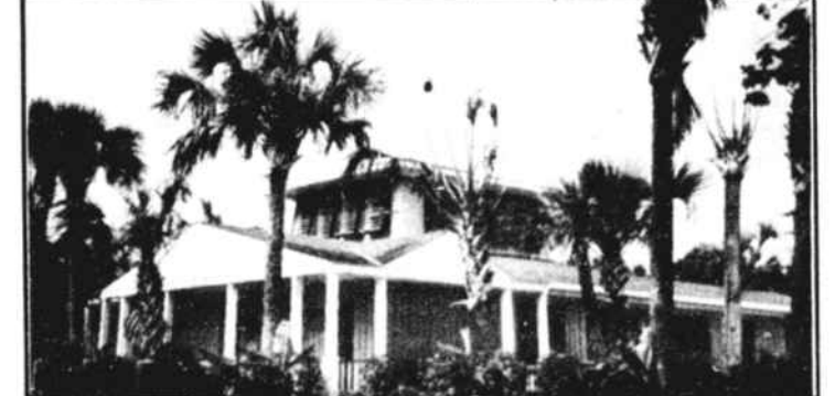
Twin Lakes Restaurant–Sunset Beach