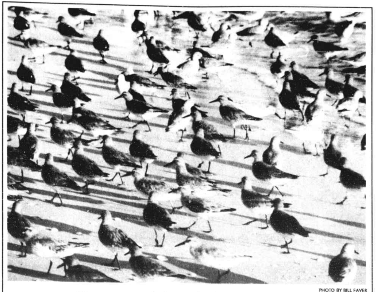
All creatures seem to be drawn to the edges for food and shelter.