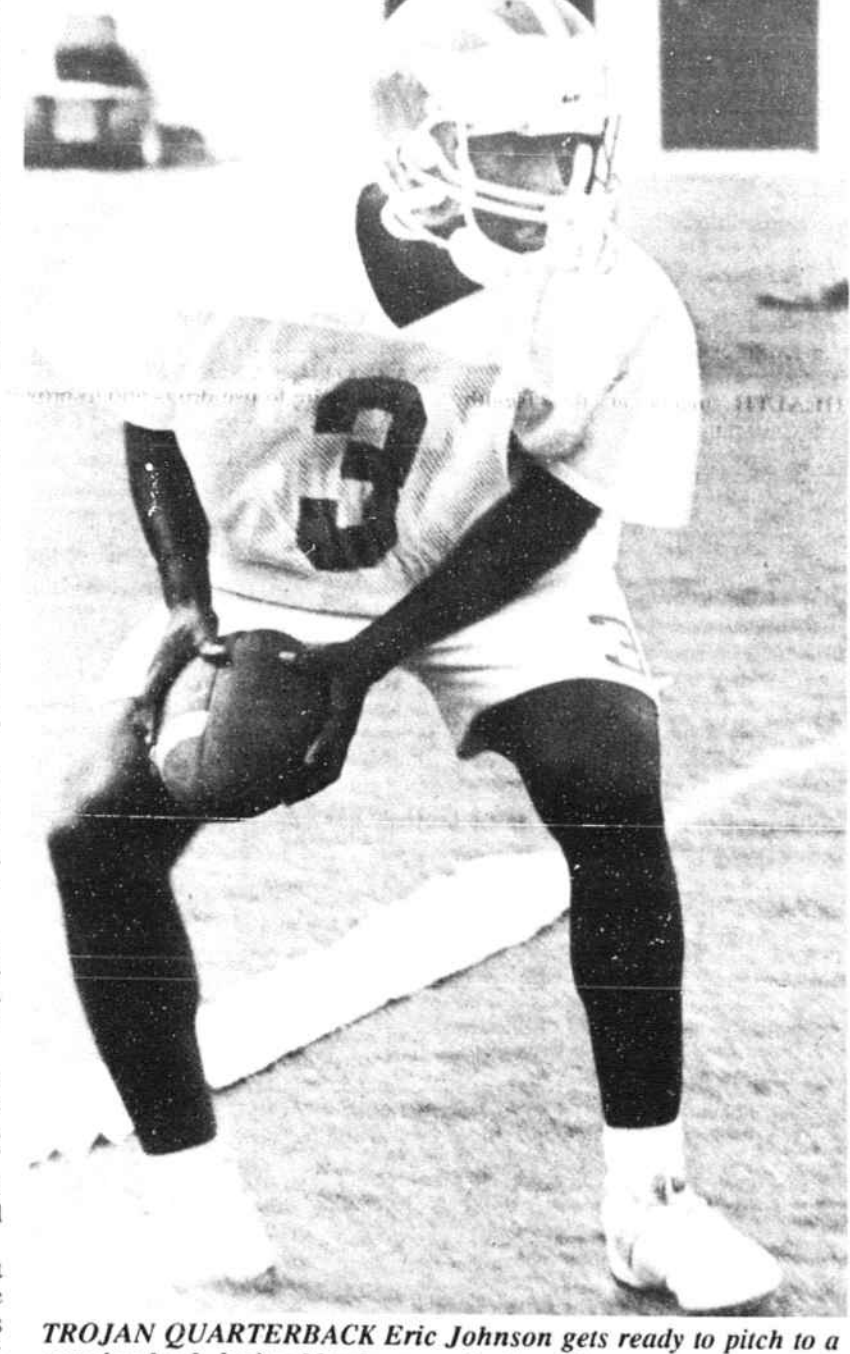
running back during Monday morning's workout.

Baldwin said 39 prospective football players showed up for the Scorpions' first practice Monday night. He expects another 10 to 12 before the sea-