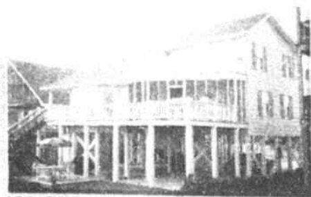
139 OBW—3 BR, 3 ba.....$283,500.