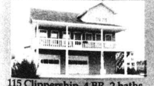
115 Clippership—4 BR, 2 baths.....$135,000.