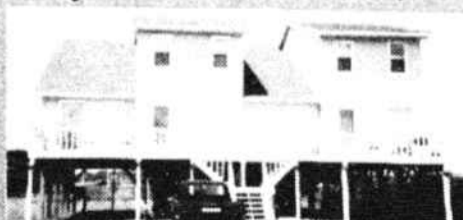
153 OBE—Duplex. Side A. $103,000. Side B.....$99,500.