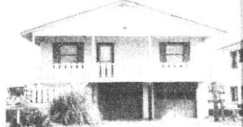
548 OBW—3 BR, 2 ba.....$124,900.