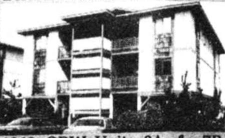
1068 OBW—Units 9A & 7B, Captain's Villas.....ea. $83,900.