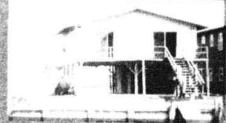
137 Charlotte Street—2 BR, 1 bath.....$105,000.