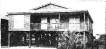
125 Salisbury Street—3 BR, 2 baths.....$154,900.