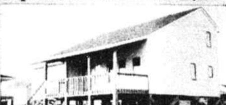
1136 OBW—4 BR, 2 ba.....$135,000.