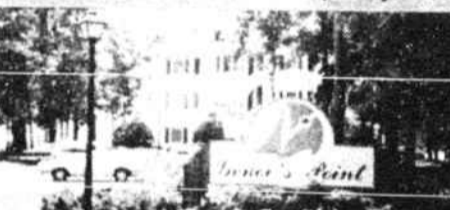
Genoe's Point Condo—Lockwood Folly Links w/member-ship.....$139,900.