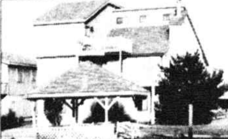
119 Charlotte Street—4 BR, 2 baths.....$179,000.