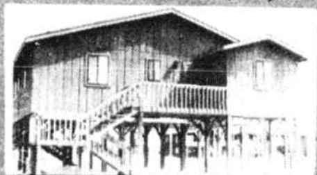
148 Dolphin Drive—4 BR, 2 baths.....$126,500.