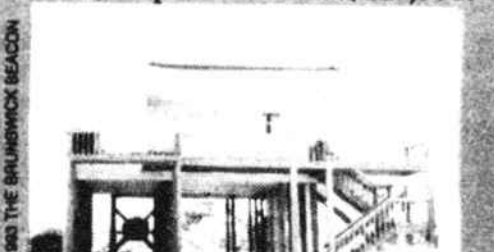
221 OBW—4 BR, 2 ba.....$239,900.