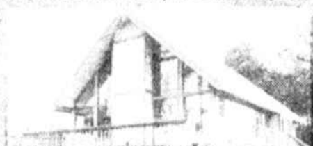
Varnamtown—2750 River Run Drive.....$189,500.