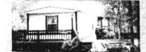
Riverside II—2 BR, 1 ba.....$29,500.