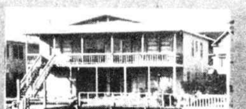
112 Fayetteville Street—6 BR, 3 baths, duplex.....$129,500.