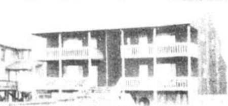
1279 Ocean Blvd. W—3 BR, 3 baths, 1/2 duplex.....$269,900.