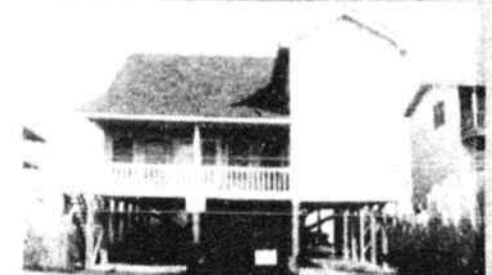
1162 Ocean Blvd. West—4 BR, 3 1/2 baths.....$164,500.