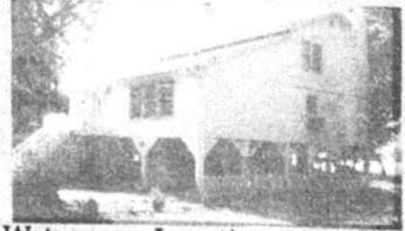
Waterway Location—2391 William St.....$185,000.