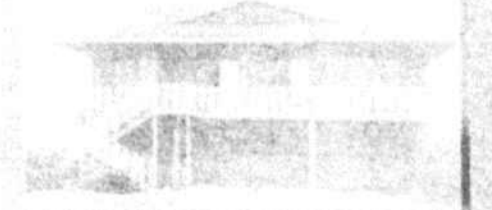
580 OBW—4 BR, 2 ba.....$124,900.