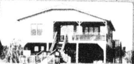
Sea Aire Canal—3 BR, 2 baths, canal/WW. Reduced.....$124,900.