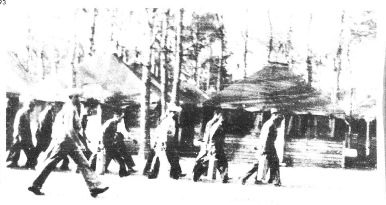
THESE BLACK INFANTRYMEN were among the 6,000 soldiers, mainly from the Northeast, who trained at the Fort Fisher antiaircraft firing range. Women piloted the aircraft that towed their targets.

Food Lion Shopping Center, Hwy. 904, Seaside Behind Hardees