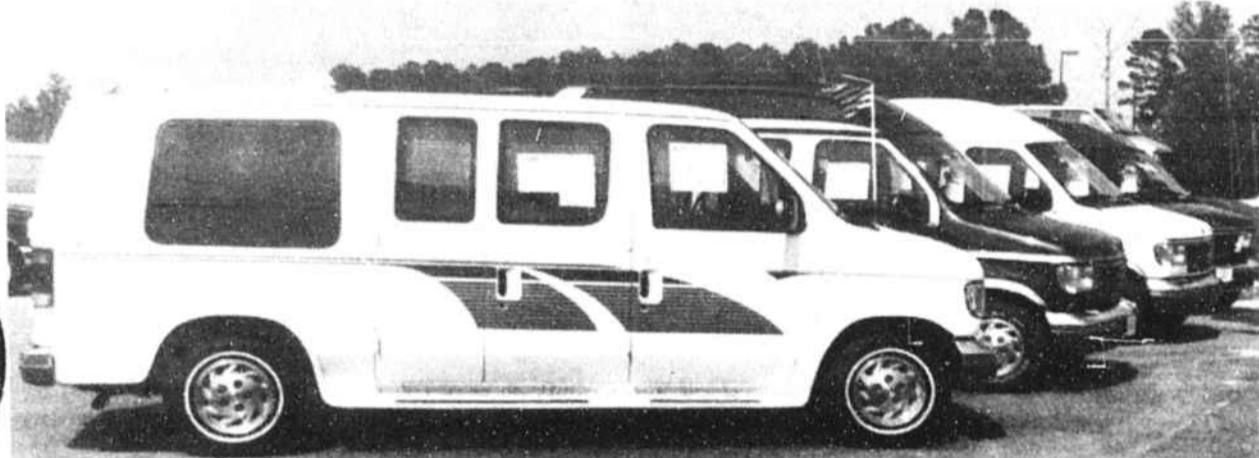
Stock #5561—5 liter V-8, hi-cap A/C, AM/FM stereo cassette, running boards, power mirrors, auto O/D, aluminum wheels, 35-gal. fuel tank and more!