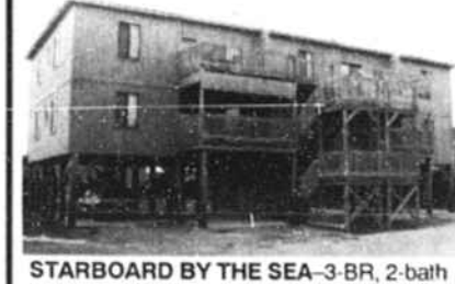
condos on OIB. amenities from oceanfron to boat slips on the sound. Units available.

Let us assist you with your next primary residence, vacation home, condo or investment property. Our expertise and professionalism will benefit you. Call today!