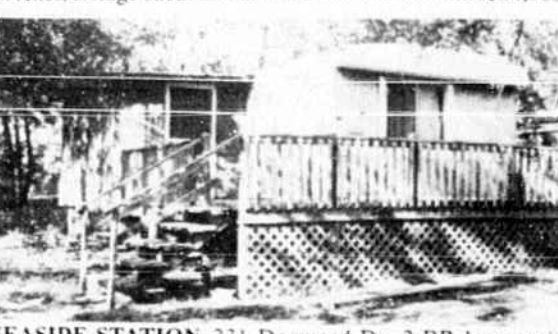
SEASIDE STATION-231 Dogwood Dr.-2-BR home with screened porch, deck and fence. Needs some repairs. Great lot AND opportunity at.

Call for complete listing of homes and homesites.