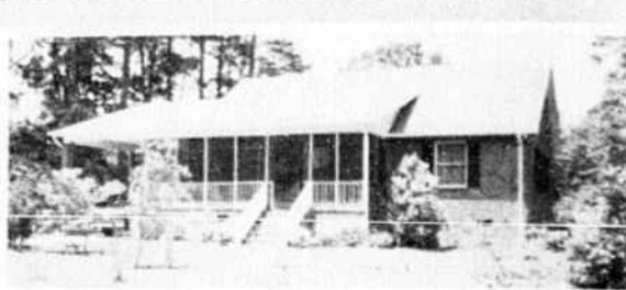
CALABASH ACRES-1130 River Drive-Brick 2-BR, 2-bath custom-built home located across street from the Calabash River with a great view. Home features carport, 2 screened porches, storage shed.