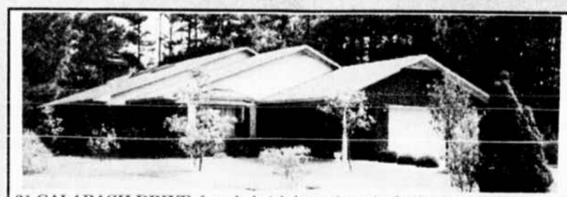
31 CALABASH DRIVE —Lovely brick home has vinyl trim for extremely low maint, tile floors in walk areas, fam rm. Huge master suite w/tray ceiling, FP, lg walk-in closet, spacious bath w/Jacuzzi, stall shower, double sinks, great dressing table. Split BR plan, formals, Carolinas rm, view of pond and 15th grn, wrp-arnd deck. 2nd FP in fam rm, skylites and sliders to deck. $167,900.