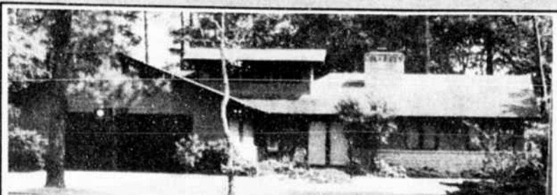
ONE PUTTER PLACE —Brick, cedar, great view on course, over 2200 sq. ft., desirable floor plan, split bedroom, open great room, beamed cathedral ceiling, fireplace, large Carolina room, Jenn Air, lots of storage, 2-car garage, beautiful trees. Come see this lovely home. Priced to sell 175,000.