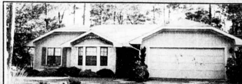
6 TOPSAIL COURT —Lovely home on corner lot. Cathedral ceiling, fireplace, skylights, split bedroom plan, many upgrades. All appliances and window treatments convey. Reduced!! Call today.