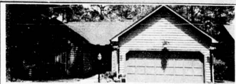
32 GATE 3 —High-ceiling living room w/see-thru FP, crown mouldings, paladium wndws, 2 sets of French drs to fam rm. Form din rm. Eat-in kit. bay wndw. Lg fam rm, skylights, view 17th fwy. 2 BR, bath for guests MBR w/walk-in closet, dble mbrl shwr. Carolinas rm., huge deck, 2-car gar. $157,900.