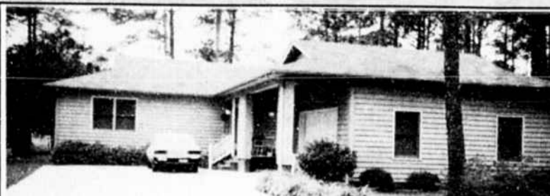
7 GATE 10 —Great price for 3 BR, 2 baths on 9th fairway, fireplace, split bedroom plan. Master bath has Jacuzzi, screened porch, deck facing fairway. 1.5 garage, many extras. Only $124,900.