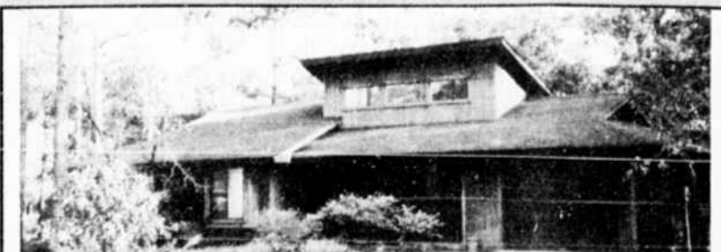
1 EGRET CT —Affordable home in highly desirable comm of Carolina Shores. Pool, tennis with golf mbrshps avail, just min away from Sunset or Myrtle Beach. Corner lot w/3-BR, 2-bath home. Vaulted ceiling in liv/din rm, 2 sliders to patio. Screened porch. Appls, wndws treatments remain. $89,900.