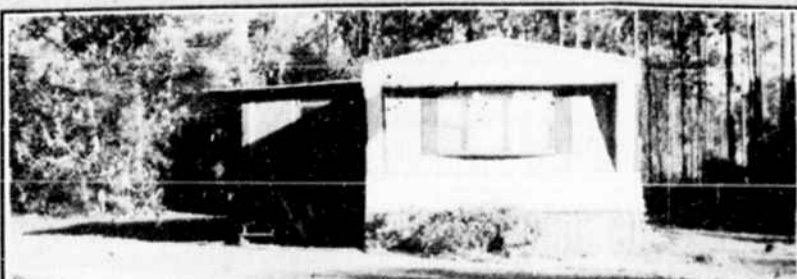
714 CYPRESS LANE —Looking for quiet get-a-way? This is it! Immaculate home with many extras built in. Screened porch plus deck. All appliances plus most of the furniture convey with home. Outside storage shed and shower. Only $28,500.