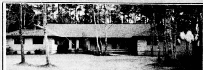
37 SUNFIELD DRIVE —Unique, one-of-a-kind home on 1 acre in golf course community with pool, tennis, clubhouse, state-of-the-art kitchen, fantastic master bedroom suite, 4 BR, great room, family room, 3500 sq. ft., stucco, maintenance free. $226,900.