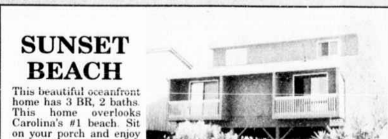
SUNSET BEACH This beautiful oceanfront home has 3 BR, 2 baths. This home overlooks Carolina's #1 beach. Sit on your porch and enjoy this breathtaking view for only $247,000.