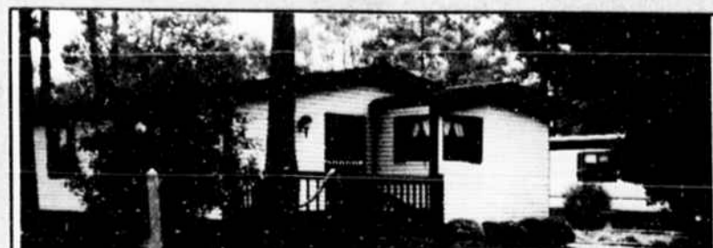
BONAPARTE RETREAT I —This lovely custom-built doublewide has 3 BR, 2 baths, utility room, porch. Beautifully landscaped, skylight, cathedral ceiling. Just reduced to $59,900.