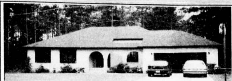
BRIERWOOD ESTATES-45 FAIRWAY DRIVE —This is an immaculate white-brick home with a southwestern flavor. Large eat-in kitchen, dining room, 3/4 BR, 2 baths, double garage, screened porch and deck. Quality features that you deserve. $114,900.