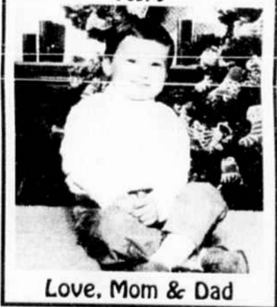
Love, Mom & Dad