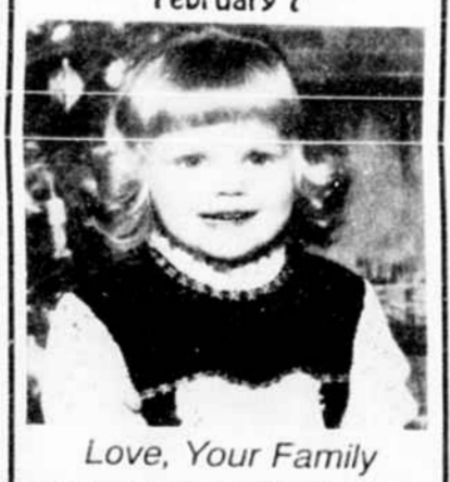
Love, Your Family