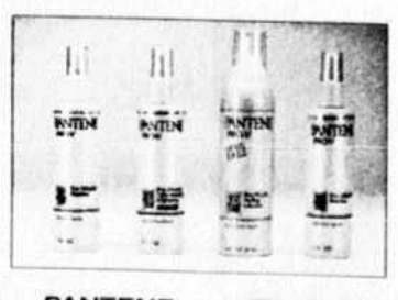
PANTENE STYLING PRODUCTS