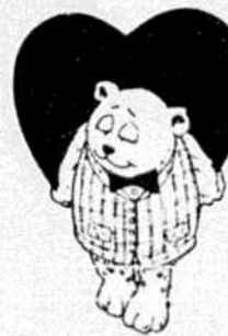
I love you always Happy Valentine's Day Your Wife, Sylvia