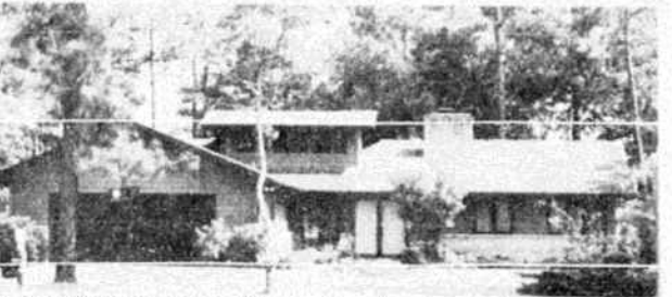
1 PUTTER PLACE-Brick and cedar, great view on course, over 2200 ht. sq. ft., desirable fl. plan, split BR, open gr. rm., beamed cath. ceiling, FP, lg. Car. rm., Jenn Air, lots of storage, 2-car gar., beautiful trees. Come see this lovely stcrage, 2-car gar., beautif home. Many extras. 175,000.