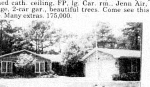
36 CAROLINA SHORES DR.-Classic brick ranch-style home w/antique brick Pella windows, quality throughout. View of 5th fwy. from lovely fam rm and patio. Custom cabinetry and built-ins. Lots of extras and upgrades. This home has