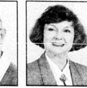
299 Sandpiper .....$84,900.